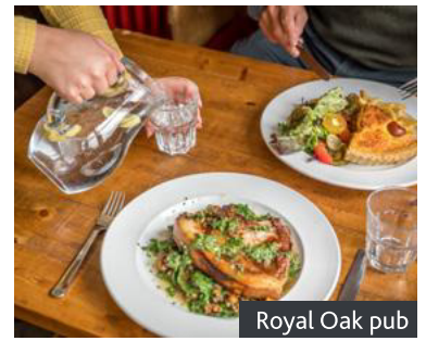
Royal Oak pub

Rejoin The Ridgeway and continue along the undulating trail - after about three miles you'll reach the Iron Age hill fort of Uffington Castle, and just beyond it the iconic landmark of the Uffington White Horse. No entry ticket is required; visitors freely wander around it. Why it was created remains a mystery although there's a theory that the image was supposed to be a dragon - this is upheld by the presence of Dragon Hill nearby, said to have been the place where St George killed the menacing beast of legend.