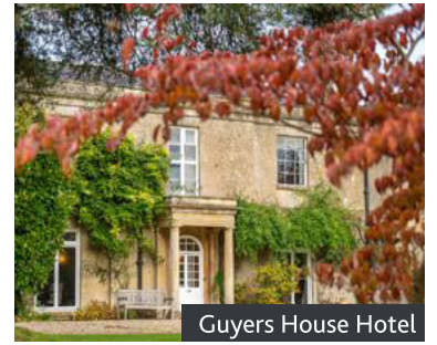
Guyers House Hotel

Hugged by hills and featuring elegant stone properties, Box is a charmer of a little town. The good looks belie a heritage of backbreaking work; the Box area was for centuries famed for its stone quarries - the peak period was between 1880 and 1910 when millions of tons of stone were cut. Walk back to Corsham south of the railway line, across fields and past old stone quarries.