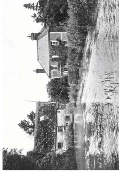
▲ Town Mill, circa 1950