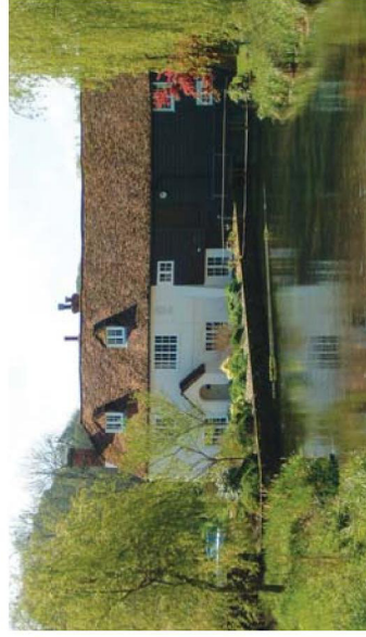
▲ Bere Mill. This and Laverstoke Mill were both paper mills owned from the early 18th Century by the Portal family. It is now a private house