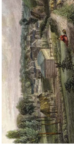
▲ Whitchurch in the Regency era.

Whitchurch is a mill town. Once a working mill was located along the River Test every half mile through the town. Today all but one of the mills have been converted into private houses. This picture was painted at a time when water power in Whitchurch was nearing its peak of industrial production.