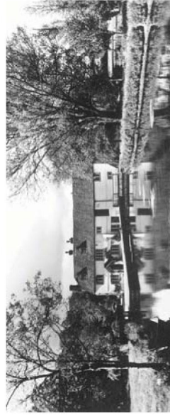
▲ The River Test in spring

The unimproved grassland bordering the river courses forms a habitat particularly rich in wild flowers and valuable to birdlife. Once such habitats were more widespread but they are now much diminished elsewhere due to agricultural improvements.