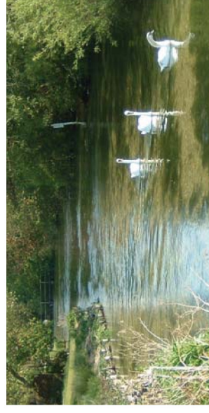
▲ The River Test

Alternatively, the Trail takes you east to Laverstoke and Freefolk and back. This 3 mile circuit, crosses and re-crosses the River Test by footbridges, and passes two more mills and the charming church of St Nicholas at Freefolk.