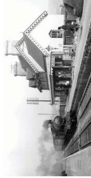
▲ Whitchurch railway station circa 1940's.