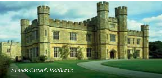
> Leeds Castle