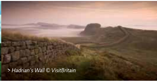
> Hadrian's Wall