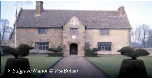
> Sulgrave Manor