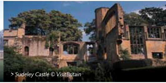
> Sudeley Castle