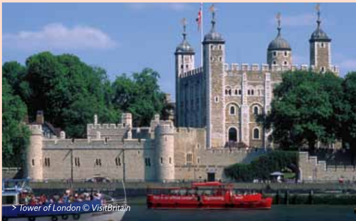
> Tower of London