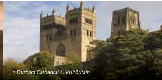
> Durham Cathedral