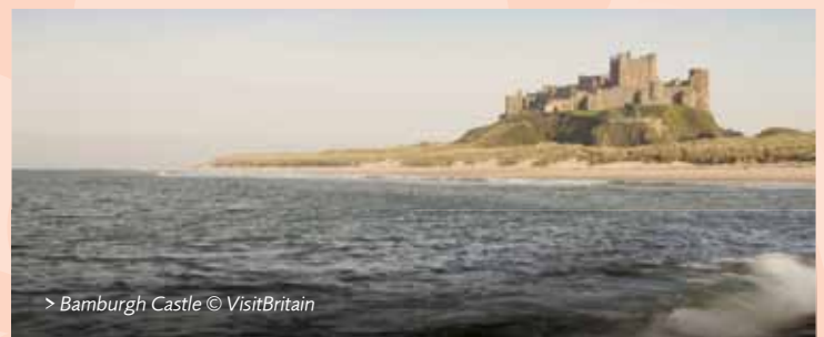
> Bamburgh Castle