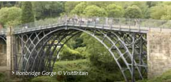
> Ironbridge Gorge

Journey back in time with England's many historic sites. This little land has been the playground for mighty empires, swashbuckling pirates, brutal monarchs and academic greats. Ponder mysterious Stonehenge, marvel at towering gothic cathedrals and bathe in the Romans' beloved hot springs.