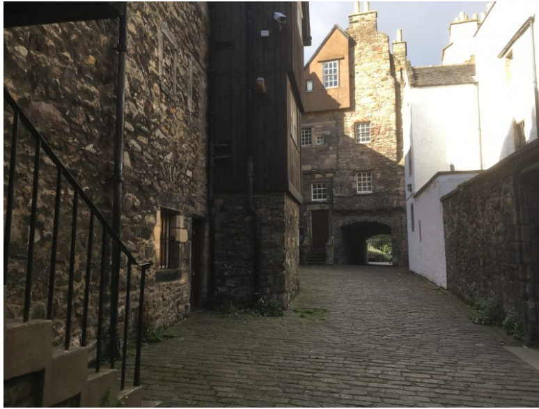
Bakehouse Close looking towards The Royal Mile (Canongate), Edinburgh