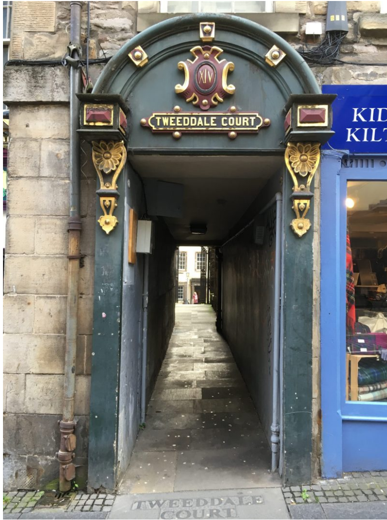
Entrance to Tweeddale Court, Royal Mile, Edinburgh