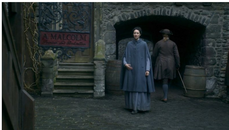
And how Bakehouse Close looks in the episode.

For visits to these and other Outlander locations within Edinburgh, please use contact@edinburghwalks.com for more information or look at our Walks page.