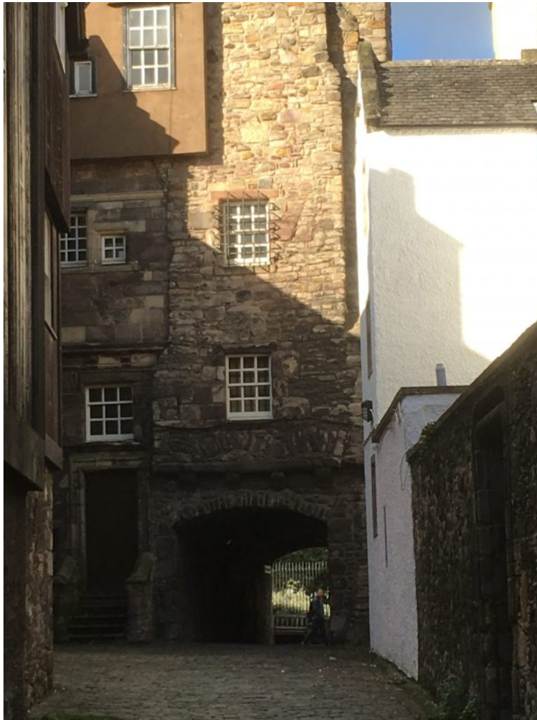
Bakehouse Close with the white Acheson House adjacent.

And a still photo from the Outlander programme;